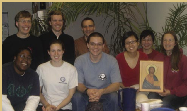
Students gather from MIT’s Lutheran-Episcopal Ministry (LEM).