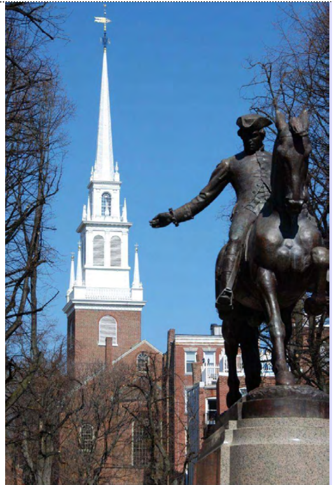
Old North Church's storied steeple