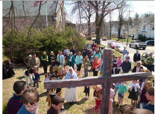
Passion Play in Plymouth