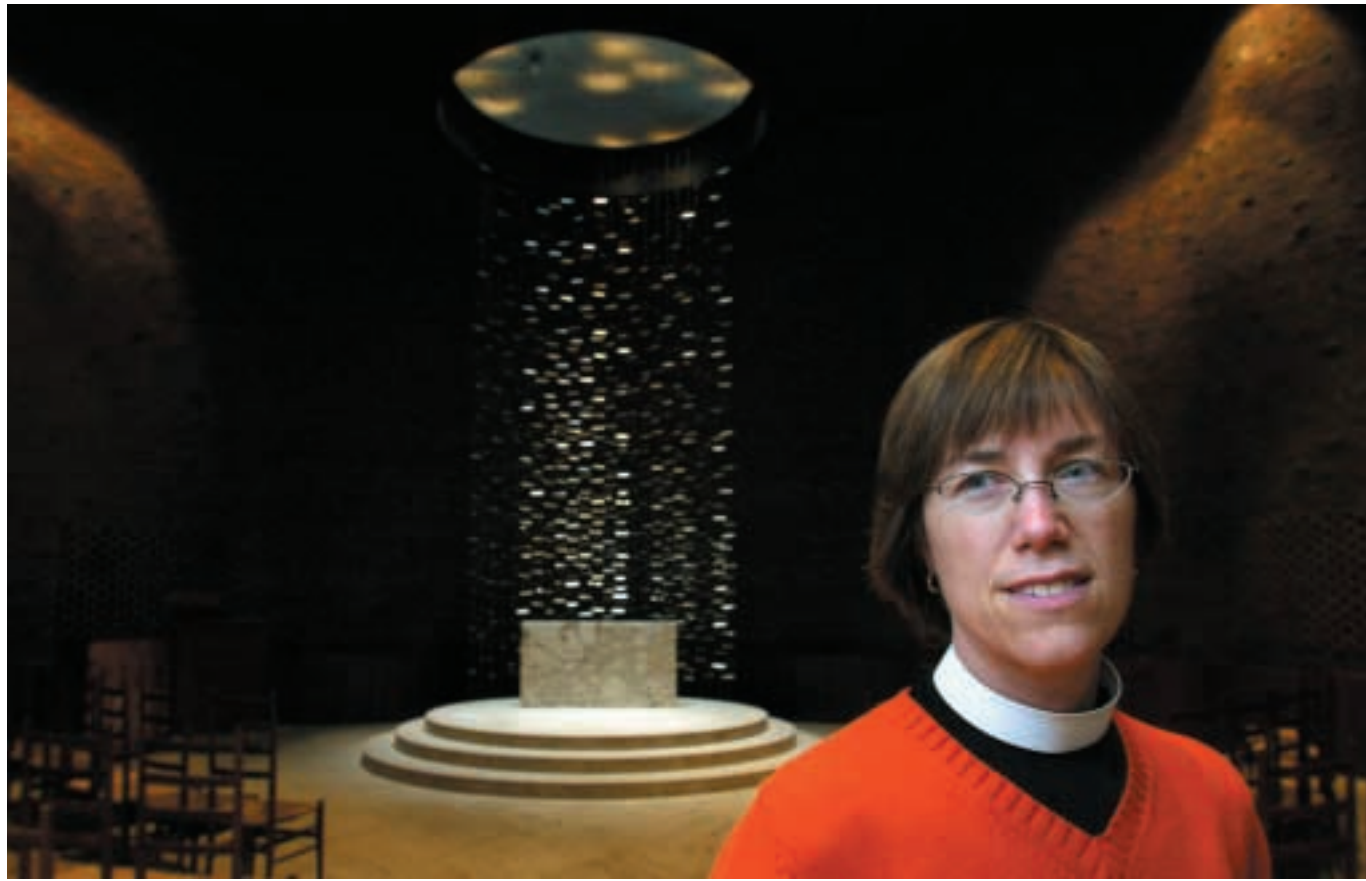
Boston Globe PHOTO: Pat Greenhouse. Reprinted with permission.