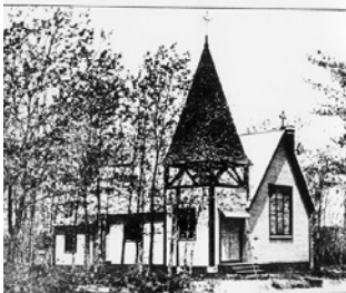
GRACE EPISCOPAL CHURCH Vineyard Haven, Mass., April 8, 1891

The first recorded Episcopal service on Martha's Vineyard occurred on Christmas Day, 1862 at Capawock Hall (now the Masonic Hall, Church Street in Vineyard Haven).