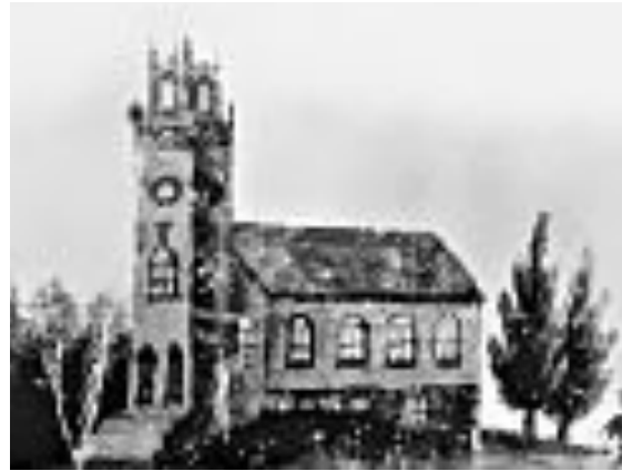
Drawn by a homesick teenager at boarding school, this is the only image of the original church shown with four windows in the nave before its length was expanded.

The beautiful white church on the Charles River has thrived since 1813. In the early 1800's "Newtowne" was a growing town of mills, taking advantage of the falls in the Charles River that later gave Newton Lower Falls its name. In 1811 a group of residents started meeting for religious services in a school house on Washington Street. The "congregation" was led by a lay reader who was studying to be an Episcopal priest. On April 7, 1812, a group organized themselves into the Society of Protestant Episcopalians. Priests from established churches in Boston and Cambridge came to conduct services for the nascent parish. In June of 1813 The Episcopal Society of St. Mary's was incorporated in the Commonwealth of Massachusetts.