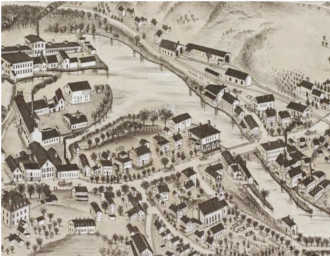
Newton Lower Falls in 1880: St. Mary's is located in the lower right-hand corner.