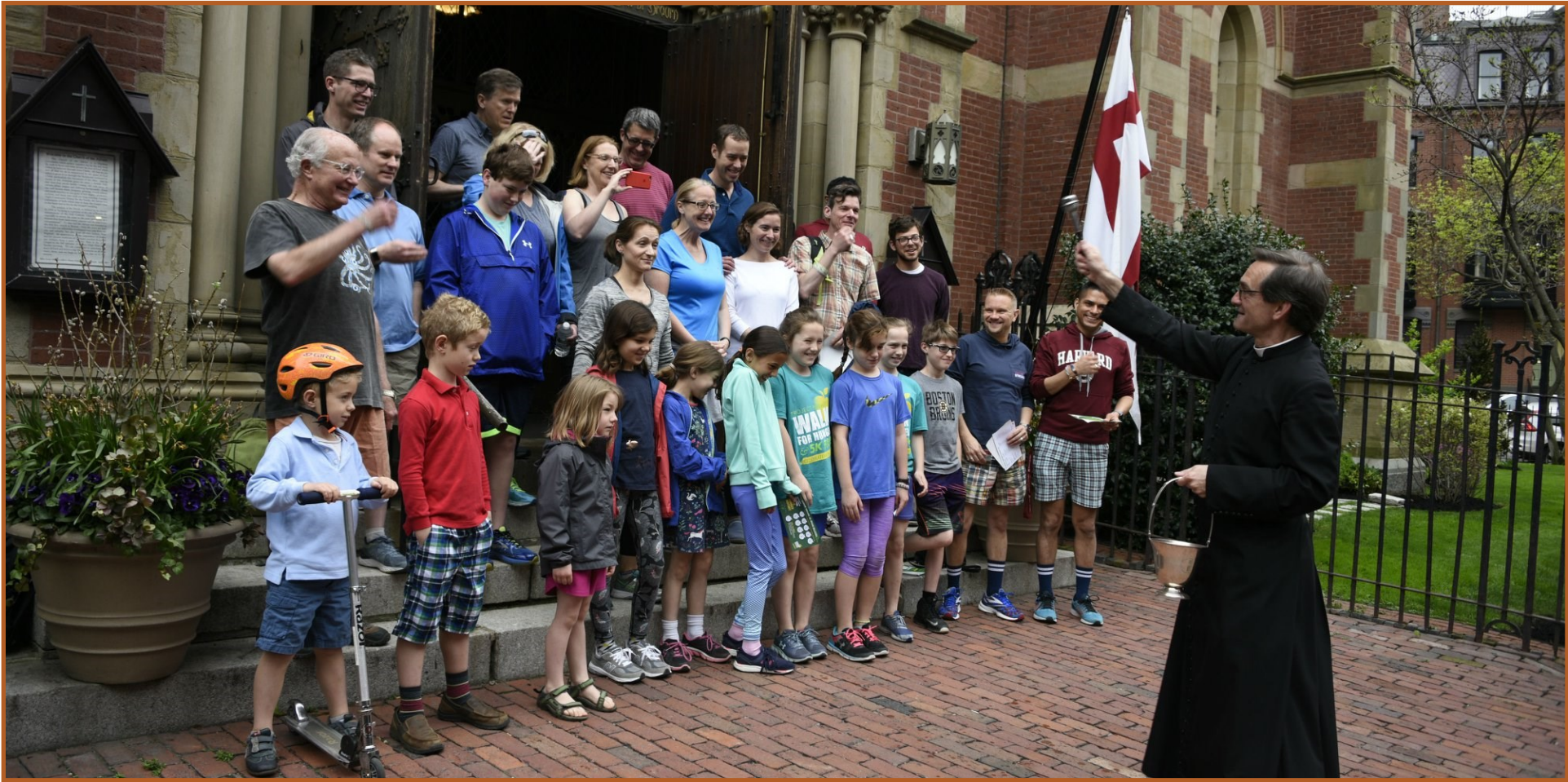
The Blessing of the Feet for the Advent Walk For Hunger Team before they set out for a 20 mile walk to raise money for Project Bread. Project Bread helps to support our Tuesday Night Supper and our goal each year is to raise at least the amount of that support.

hungry people in other parts of the world. hungry people in other parts of the world.