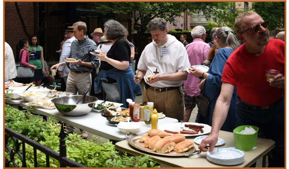
The Annual Parish Picnic in the church garden