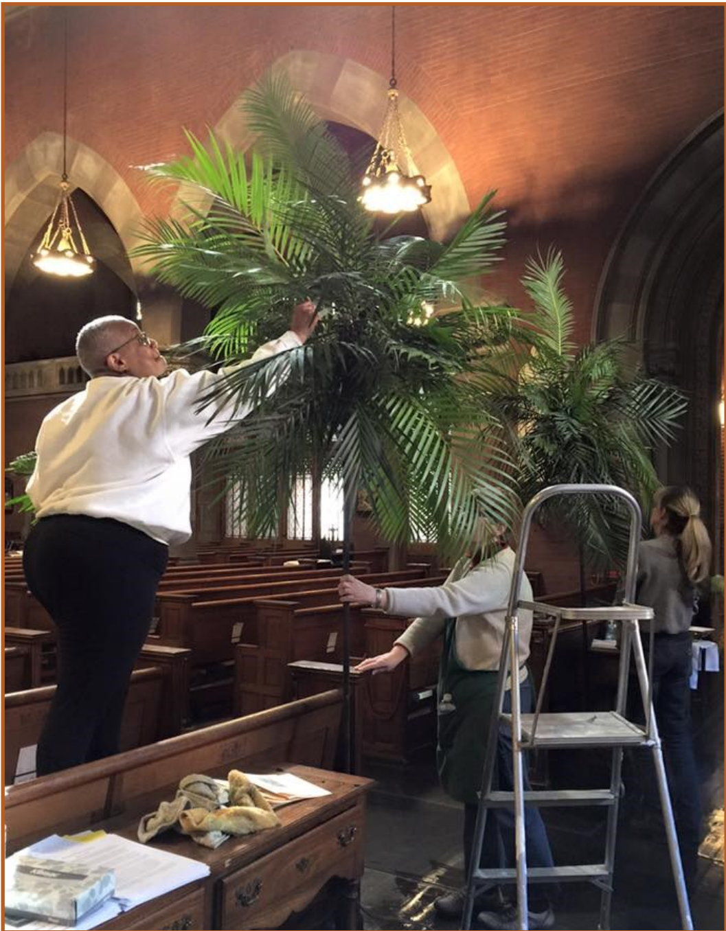
Volunteers getting the church ready for Palm Sunday

The fellowship associated with these voluntary activities and guilds plays a vital role in the life of our parish, which is composed of members from a very broad geographic area — we are at present much more of a destination parish than a neighborhood one, and most of our members come to know one another within our walls, and then take those relationships out into their wider lives. From these interactions, we become a Christian family, and we learn to practice living like one.