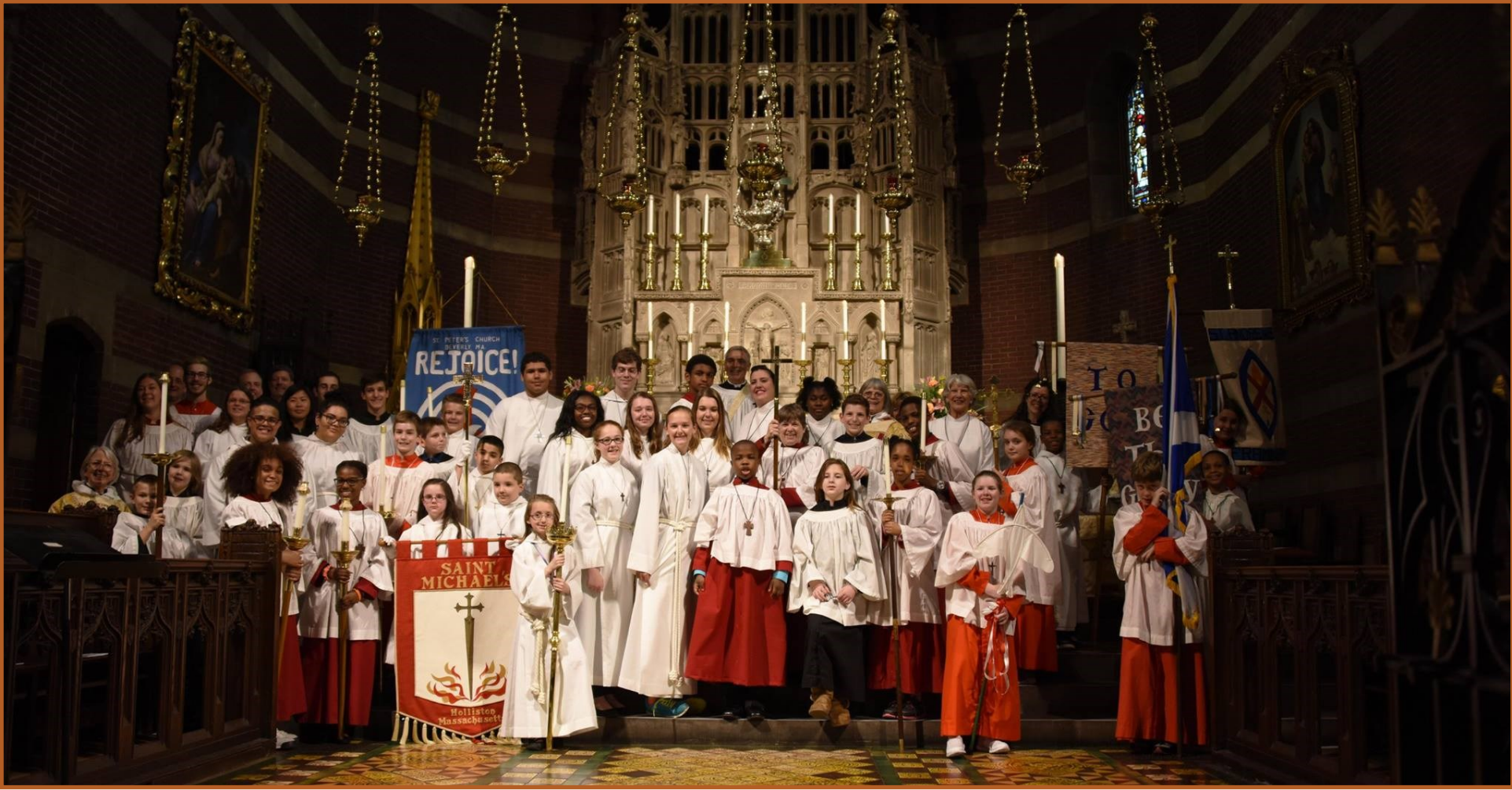
After a day of training in various roles at the Advent's first acolyte festival, young acolytes from around the Diocese gather before Mass.

The Church of the Advent also leads a pilgrimage every two years to places such as the Holy Land, following the path that Christ walked and taught, as well as other trips that follow the travels of St. Paul the Apostle in Turkey and Greece. These trips mainly include Adventers, but also welcome people from other churches and other faiths.