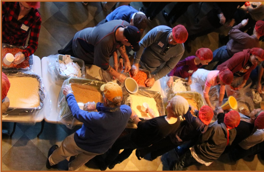
Advent volunteers packed up 10,000 meals for Rise Against Hunger