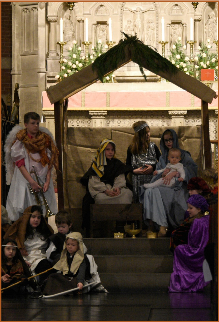
The Christmas Pageant

The Advent Church School registered over 50 children for the 2018–2019 school year. There are four different curricula, structured for different age groups, within the church school. Beginning with infants through age three, we use Beulah Land, a Bible-based curriculum, to introduce Christian concepts to our youngest. For children aged three through six, we use Godly Play, a Montessori-based Christian education curriculum designed to help children explore their faith through story, to become familiar with religious language, and to enhance their spiritual experience through wonder and play. For children aged seven through ten, we use the program Weaving God’s Promises, a comprehensive three-year curriculum prepared exclusively for the Episcopal Church. Our junior-high classes train our young parishioners to think critically and to use the tools provided by our Anglican heritage, in particular the Prayer Book. They learn how the Mass works and experience how liturgy is a vehicle that enables their personal worship of God. Our high-school class explores the weekly lectionary readings and prepares students for Confirmation.