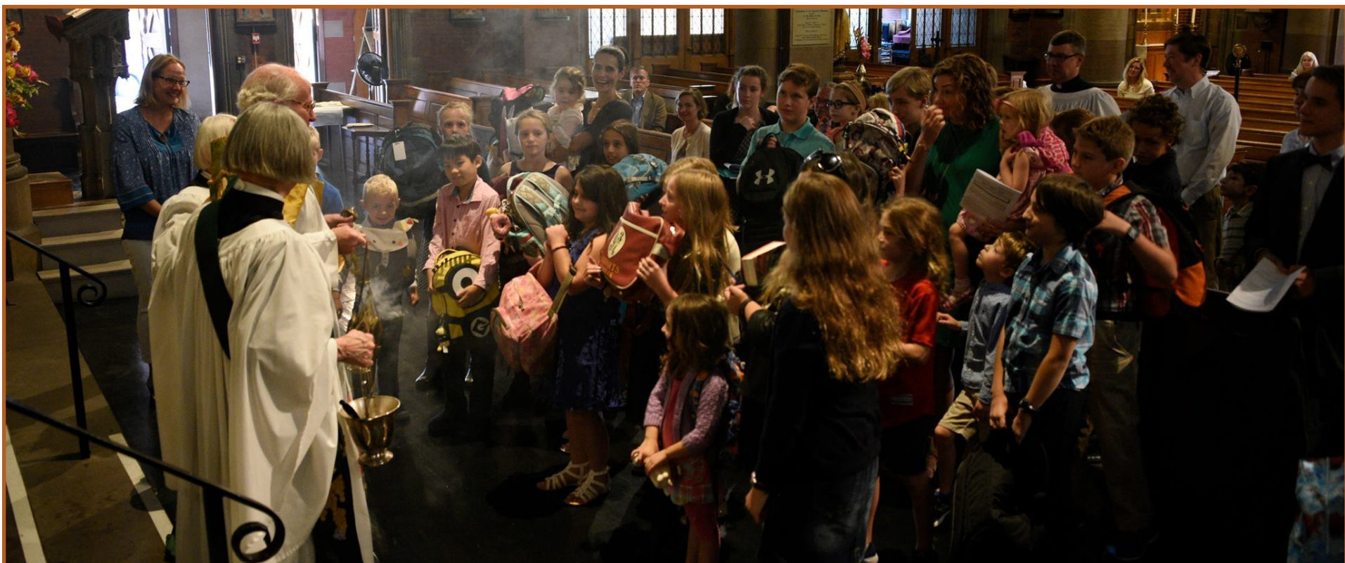
The Commissioning of Church School Teachers & The Blessing of The Backpacks