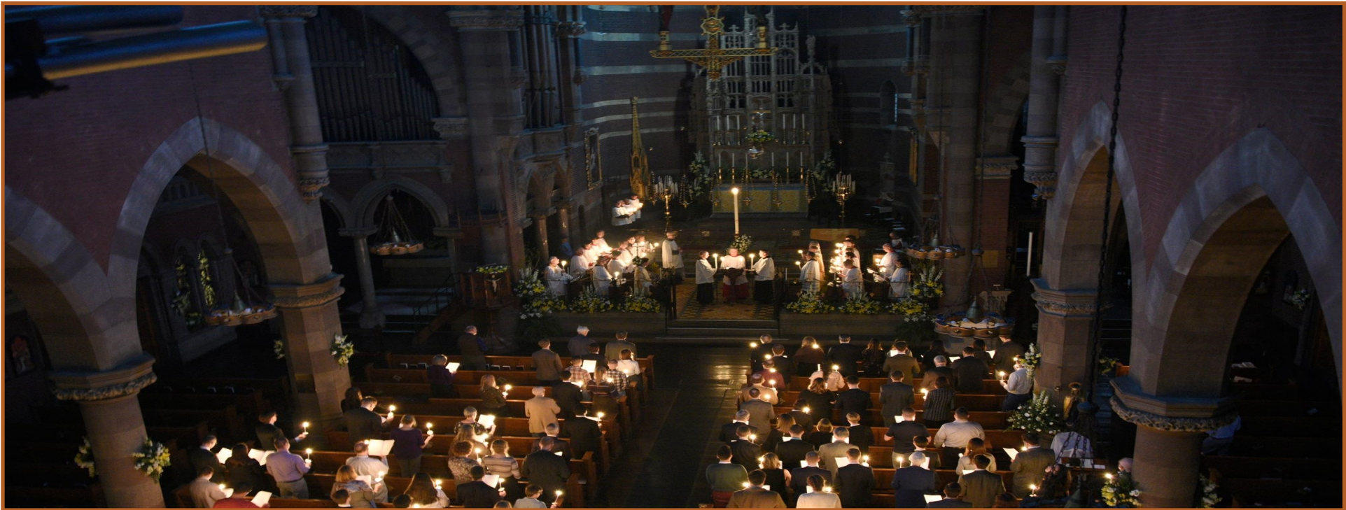
The Easter Vigil

more women in leadership roles at the parish. We are sensitive to the need for more intentional cultivation and encouragement of the many talented women in the parish to take positions of leadership.