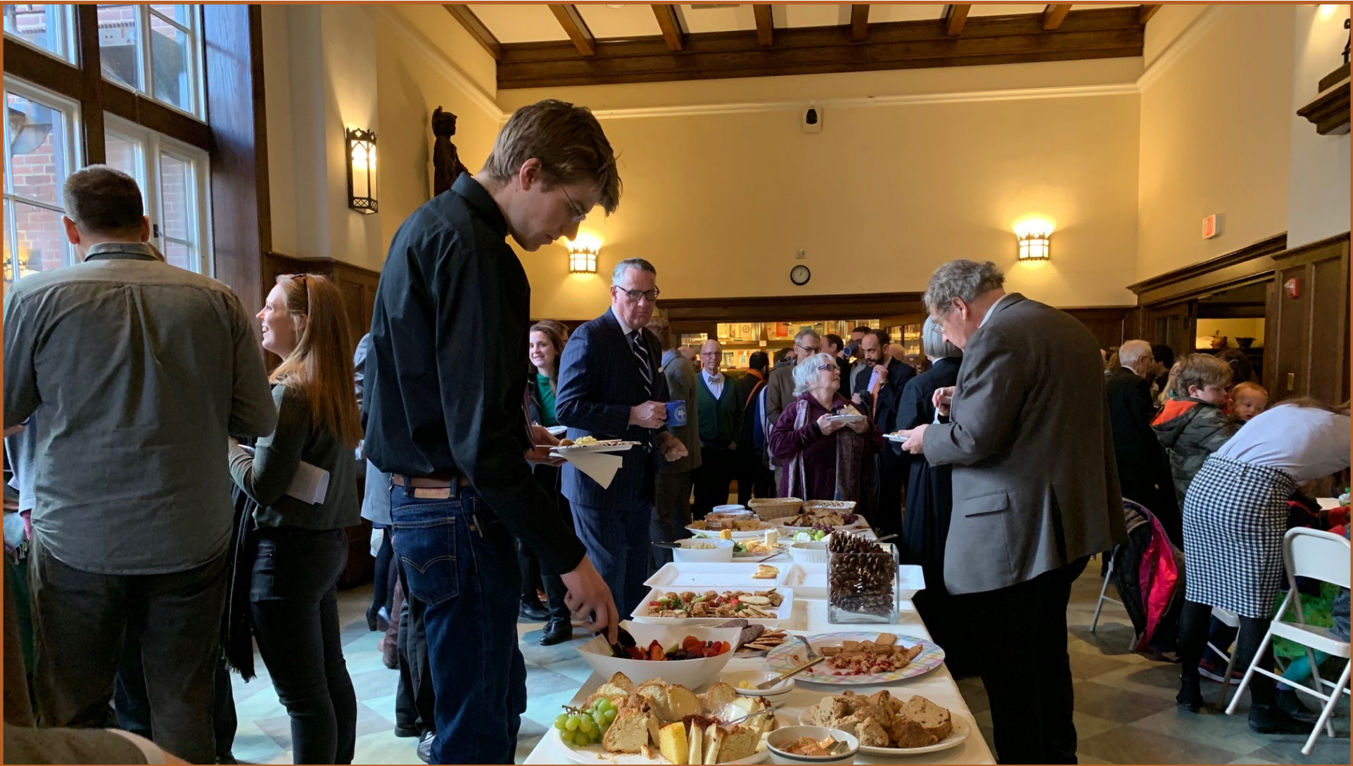
Coffee hour after the 11:15 AM Mass

The coffee hours after each Mass are particularly important, as they are often the way newcomers meet parishioners, and existing parishioners deepen and broaden their relationships within the parish. We strive for a welcoming spirit, and often the conviviality after the Masses lasts for several hours and spills out into the garden, enabled by an often-groaning board and the occasional libation appropriate to any Sunday or