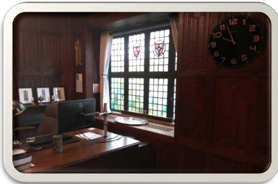
The windows and paneling in the rector's study were once part of Ralph Adams Cram's personal offices, in France and Boston. The paneling is of linen-fold design, and the windows and door medallions depict the architects' coat of arms.

The current granite church is an English country church design. The sacristy altar from the old wooden church was moved into the new chancel and a second altar was installed in All Saints' Chapel.