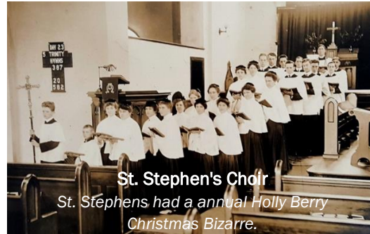
St. Stephen's Choir

O ur church was founded in 2008 when three Fall River parishes voted to merge. The three parishes were St. John's/St. Stephen's Partnership Church, St. Mark's Church and Church of the Ascension whose (former) building we now call home.