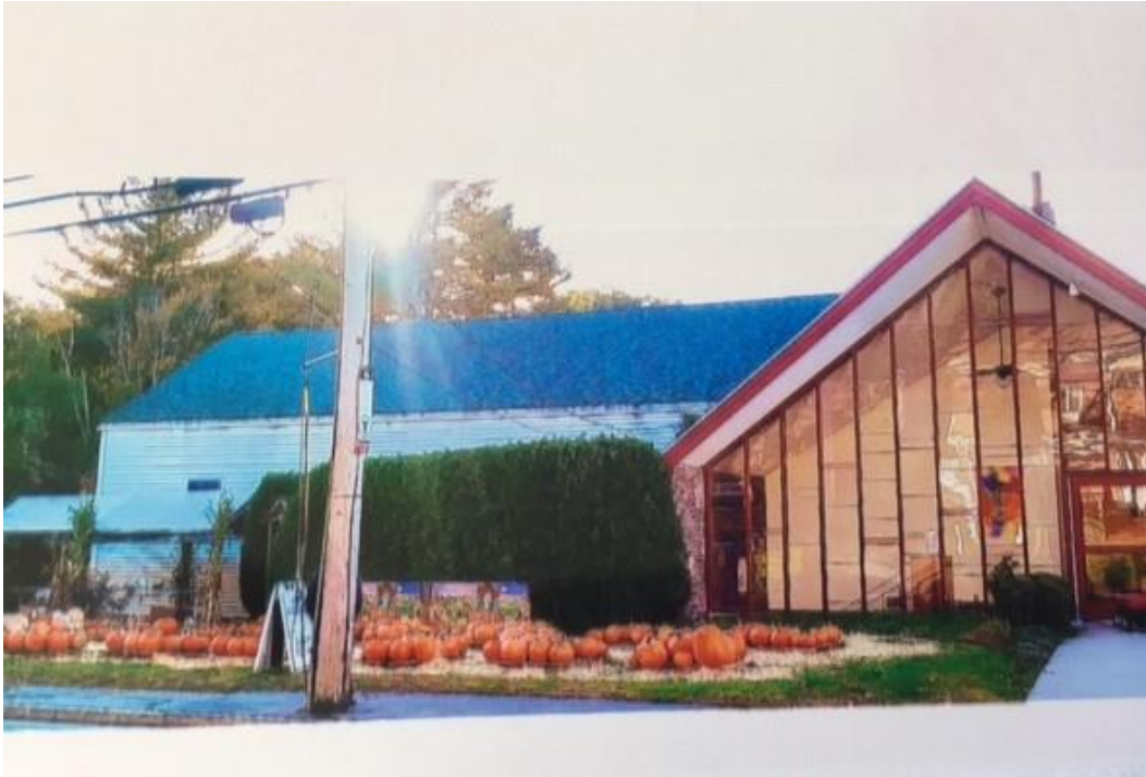
St John's Pumpkin Patch 2018. Proceeds were collected for our church and shared with the Navajo Nation in New Mexico.