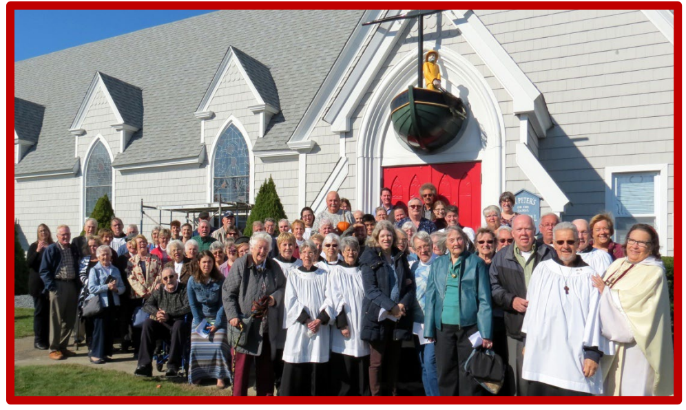
considering our Parish