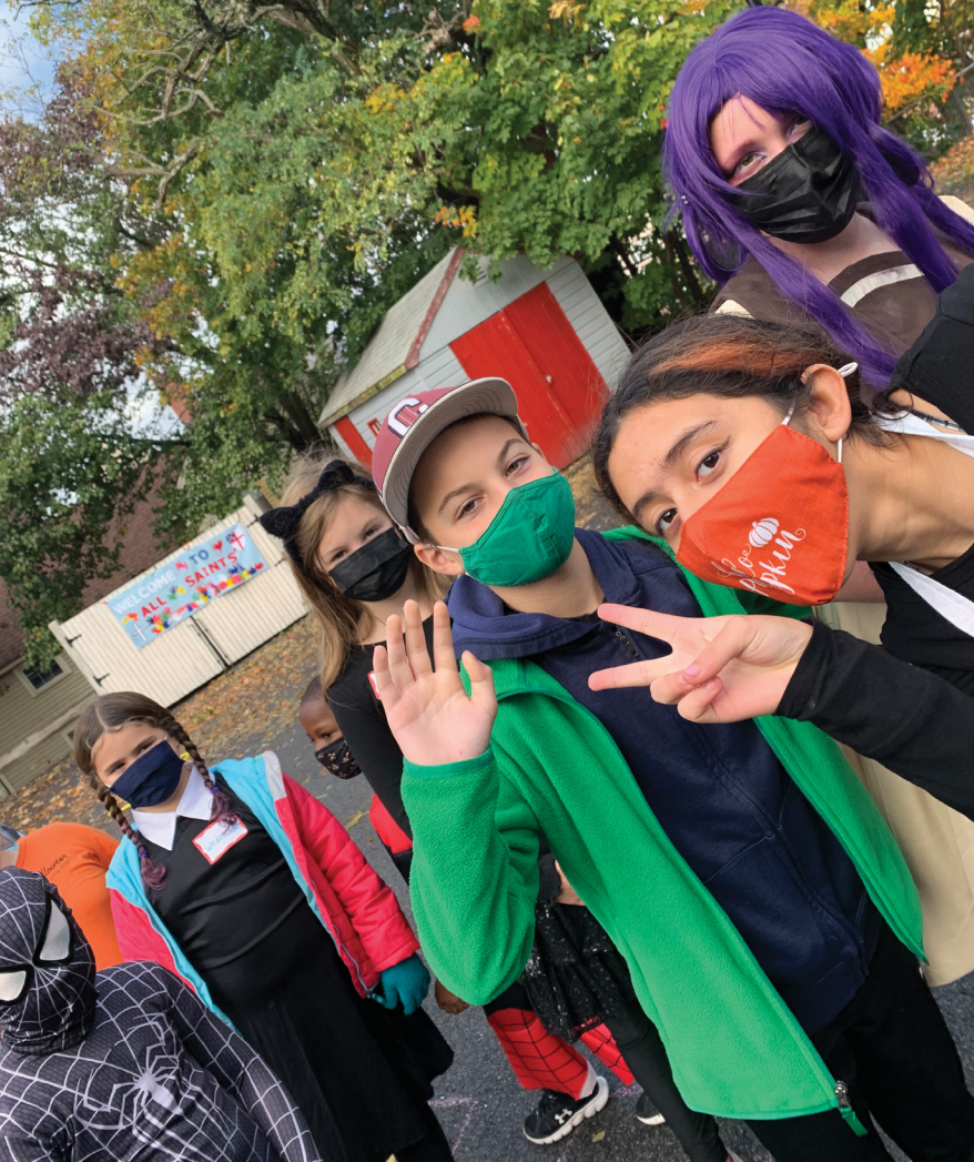
Youth program in Chelmsford