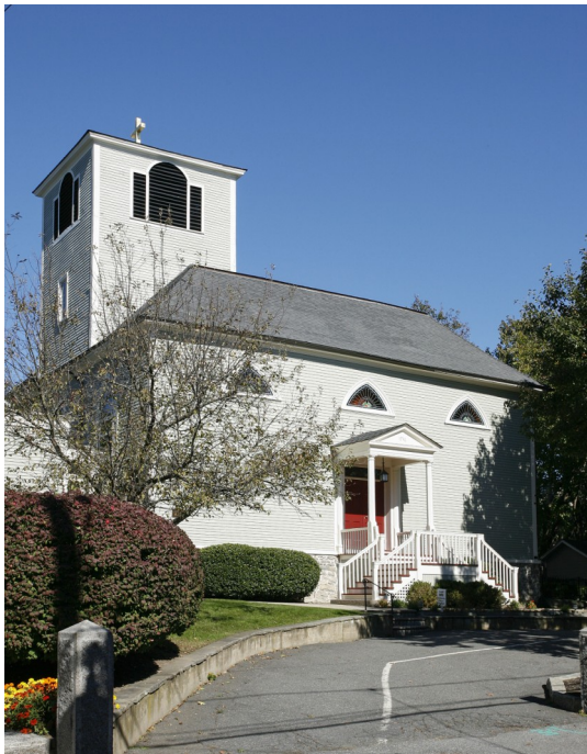
St. Michael's Episcopal Church, Marblehead, Massachusetts. Erected 1714, extended 1728, renovated 1833.

PHS Annual Meeting Saturday, May 10, 2014 St. Michael's, Marblehead