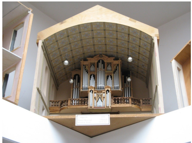
Greg Bover points out different models of organs C. B. Fisk & Co. has built. Pipes of all sizes are built