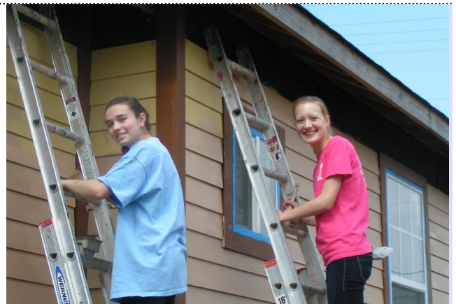
Two young members of St. John's Church in Westwood help paint a home in New Orleans.

participated, April 17-24, in a rebuilding program sponsored by Episcopal Community Services in the Diocese of Louisiana. Five adults and five high school youth worked on a home in New Orleans's Ninth Ward.