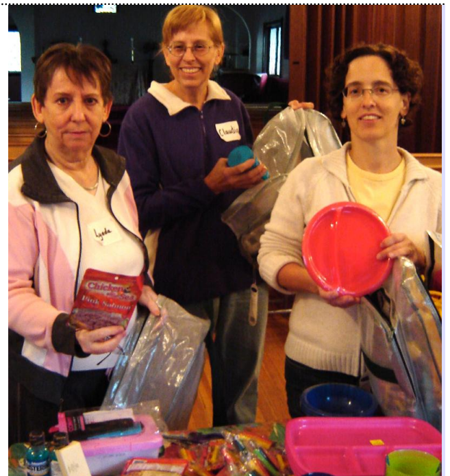
Volunteers collect and pack supplies for Haiti earthquake survivors.